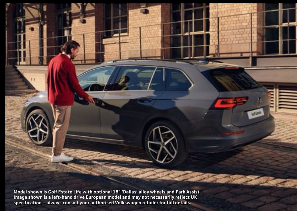
Model shown is Golf Estate Life with optional 18" 'Dallas' alloy wheels and Park Assist. Image shown is a left-hand drive European model and may not necessarily reflect UK specification – always consult your authorised Volkswagen retailer for full details.

RDE2 refers to Real Driving Emissions Step 2.