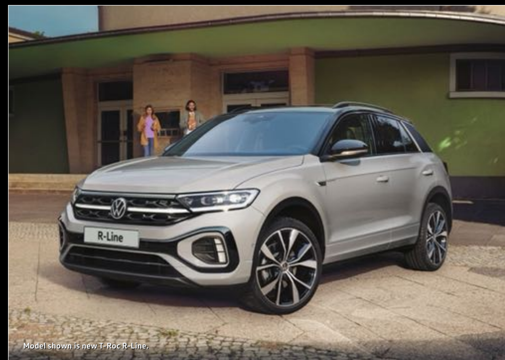
Model shown is new T-Roc R-Line.

All vehicles include metallic paint unless otherwise stated.