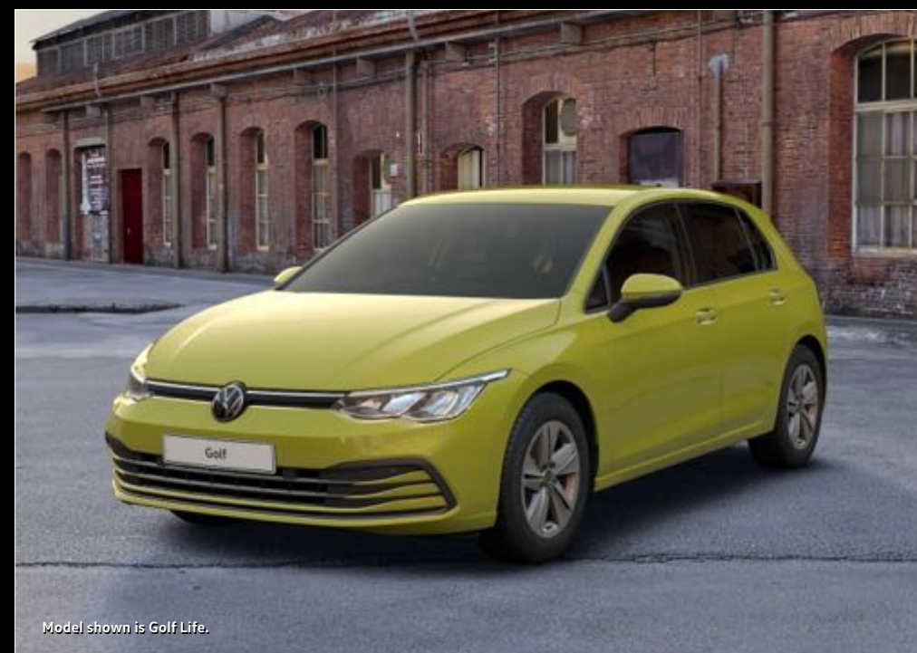
Model shown is Golf Life.

RDE2 refers to Real Driving Emissions Step 2.