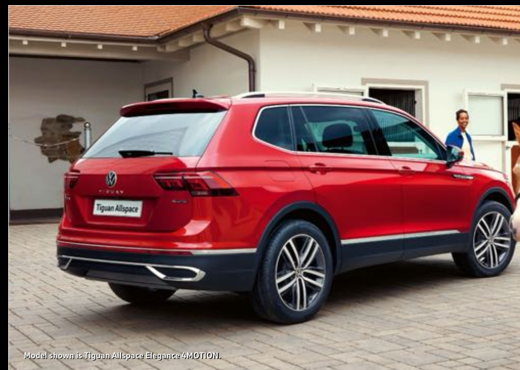
Model shown is Tiguan Allspace Elegance 4MOTION.

RDE2 refers to Real Driving Emissions Step 2.