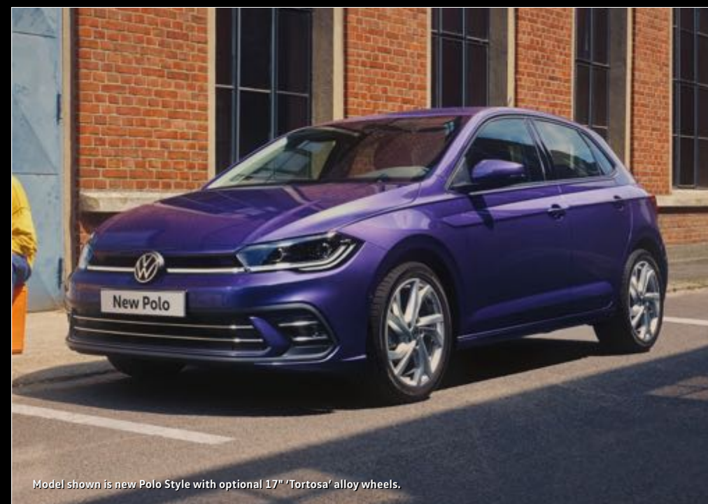
Model shown is new Polo Style with optional 17" 'Tortosa' alloy wheels.

All vehicles include metallic paint unless otherwise stated.