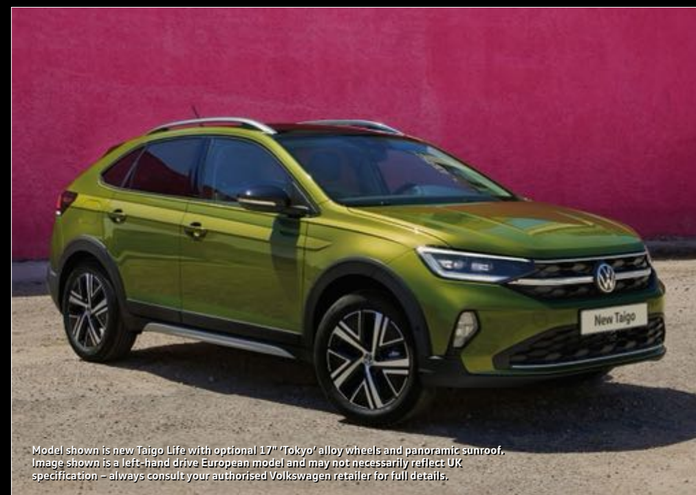
Model shown is new Taigo Life with optional 17" 'Tokyo' alloy wheels and panoramic sunroof. Image shown is a left-hand drive European model and may not necessarily reflect UK specification – always consult your authorised Volkswagen retailer for full details.

RDE2 refers to Real Driving Emissions Step 2.