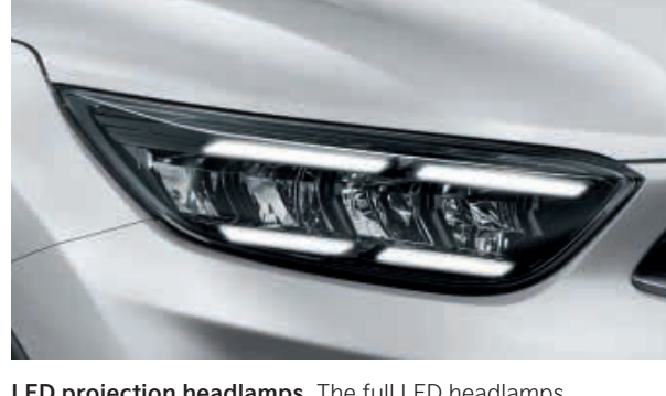
LED projection headlamps. The full LED headlamps produce a more powerful and precise light, allowing you to better detect obstacles at night (grade dependent).