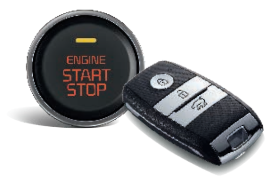
Smart Key & Engine Start/Stop Button. Not need to take your key out of your pocket or handbag. You can access your car and start the ignition with a mere push of a button (grade dependent).

Whatever your needs, the Stonic offers a wealth of equipment to help make it feel like it was custom-made for you from the start.