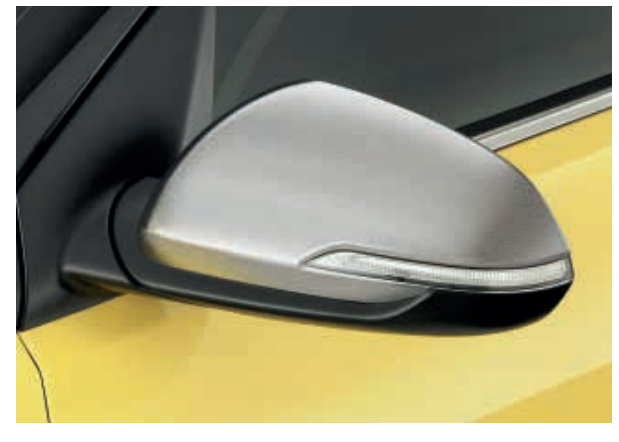
Door mirror caps, brushed. Attention to detail can make all the difference. Raise the overall visual impact of your Stonic by complementing its exterior styling with these brushed stainless steel caps. Also available in chrome optic.