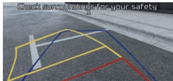
Reversing camera. The 8-inch touchscreen displays the image from the rear-view camera with dynamic guidelines to help you steer your Stonic into place (grade dependent).