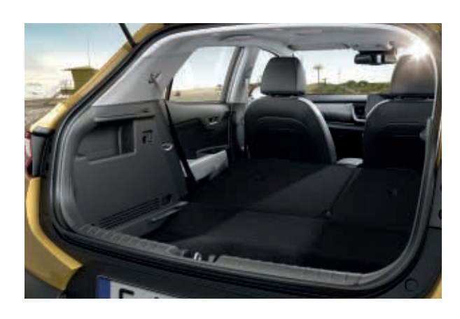
Adjustable cargo floor. Position the cargo area floor higher to be flush with the folded seat backs (left) or lower to accommodate tall items (right). Note that the cargo floor in Mild Hybrid versions is always positioned lower.

When routine is the last word on your mind, the Stonic is designed to put your plans and dreams in motion. With 60:40 split rear seats, a spacious interior and flexible luggage capacity provided by the 352-litre boot, it's easier than ever to set out and explore.