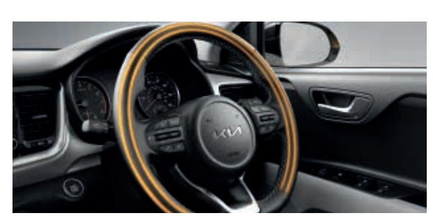
Heated steering wheel. Give your fingers some welcome respite on cold winter days thanks to the Stonic's heated steering wheel (grade dependent).