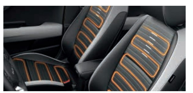
Heated front seats. With three adjustable warmth settings, the heated front seats and seat backs warm up quickly and then level off after the desired temperature is reached (grade dependent).