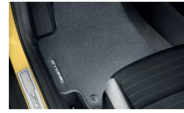
Velour carpet mats. Keep your cabin unblemished for longer. These high-quality velour carpet mats will protect your car's interior from everyday dirt and enhance its look at the same time. Tailor-made to fit the footwells perfectly, they feature the Stonic logo in the front row and are held in place with fixing points and anti-slip backing.

True style is knowing your own mind and expressing your own personality. That's why the Stonic comes with a range of custom-designed accessories from eye-catching side trims to striking entry guards and more. Here's just a small selection of the wide range you can choose from to make your Stonic uniquely yours.