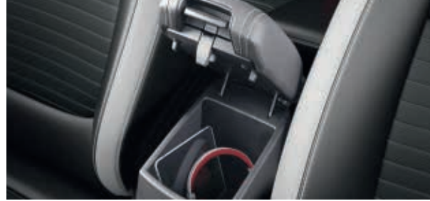
Centre console armrest. The comfortable sliding armrest is integrated with a console that includes two cupholders and a storage compartment.