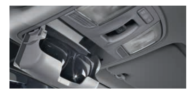
Overhead console lamp with sunglasses case. An overhead console helps you stay organised and keeps your sunglasses just where expect them to be.