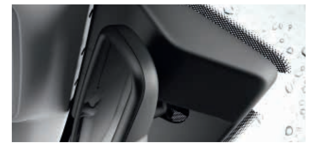
Rain sensor. Your front wipers activate when rain is detected on your windscreen (grade dependent).