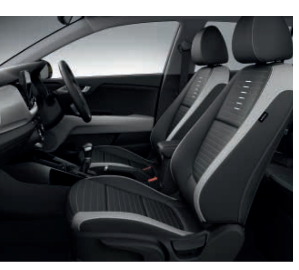
Black Cloth & Grey Faux Leather Upholstery. The interior is upholstered in a combination of soft tricot and woven cloth with a muted dark grey pattern. The coordinated door and dash trim provide a consistently fresh and relaxing environment.

dash feature trim and painted metal in colors that complement the shades of the cloth trim.