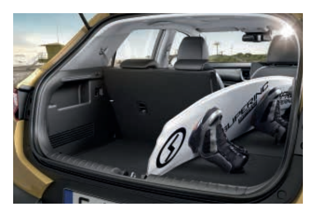
60:40 split-folding rear seats. The rear seat backs split 60:40 and fold flat separately, offering you useful choices for managing cargo and passenger space.