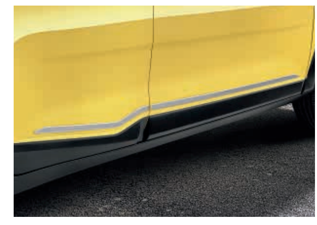
Side trim lines, brushed. Uniquely elegant, these brushed stainless steel mouldings give the side contours of your Stonic a new lease of life with a subtle optical touch. A set of 4, also available in chrome optic.