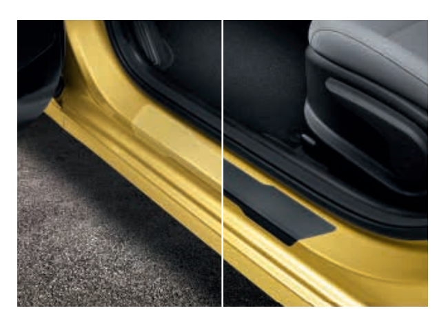
Door sill protection foils. Driver and passenger feet can cause everyday wear and tear to your door sills over time. Protect them with a new surface layer and add these durable foils. Available in black and transparent.