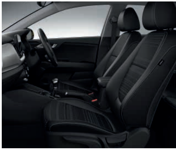
Black One-Tone Interior. Standard cloth. A pleasing combination of soft tricot and lightly patterned woven cloth seat material provides comfort and support. The doors and

Whether your style is urban or outdoorsy, let your personality shine through with a Stonic interior treatment and make your own personal statement.