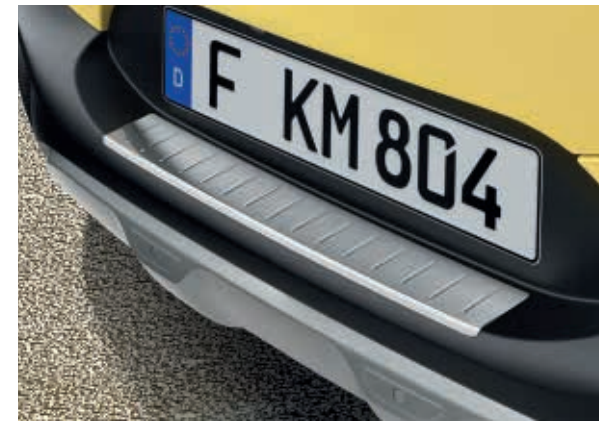
Rear bumper protector, brushed. Whenever you load and unload heavy objects or luggage, this sturdy yet stylish stainless steel protector provides an effective shield to your rear bumper. Also available in chrome optic.