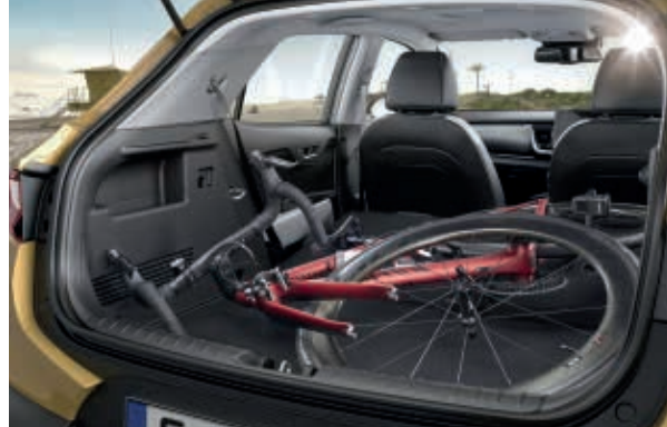
Folding rear seats. Rear seats fold nearly flat, so you can fit long or bulky items in the extended cargo space.