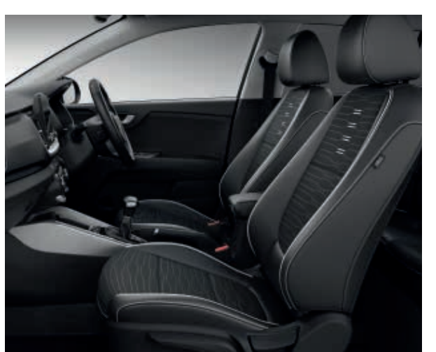
GT-line Black One-Tone Interior.

The GT-line interior includes a GT-Line logo on the steering wheel, a carbon-finish dashboard and a D-cut steering wheel in perforated leather with white stitching. Ergonomically designed seats in black cloth and faux leather feature white stitching and white piping trim for extra style.